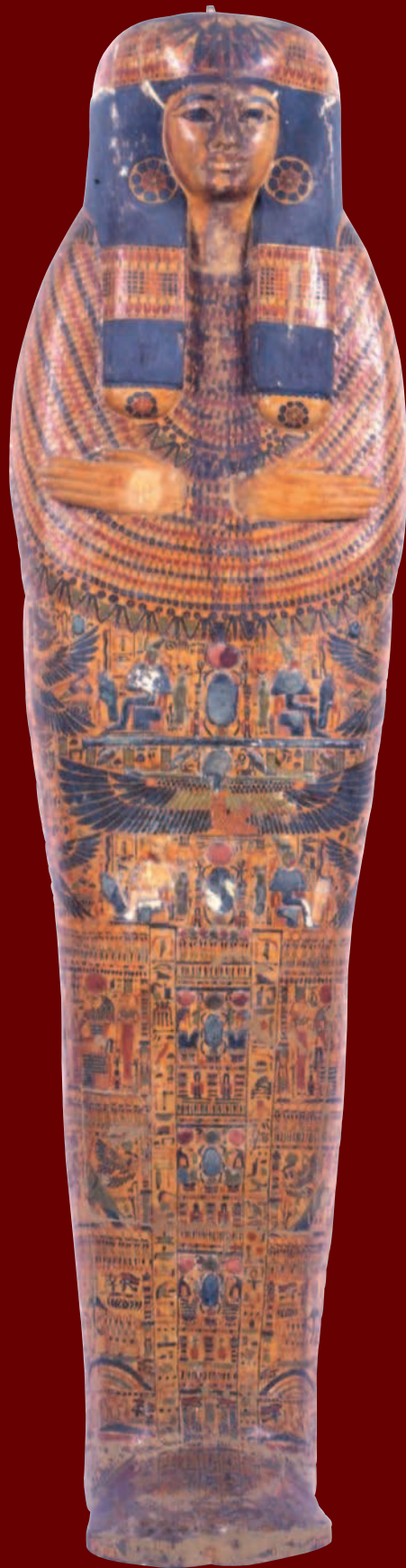
Sarcophagus of Aneth