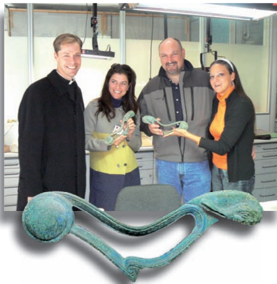
II century B.C. Bronze Swan Decoration which in Roman times was used for adorning the head of the beds.