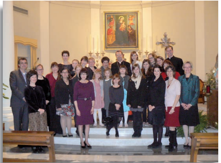
■ In the Chapel of Mary Mother of the Family, with HE Giovanni Card. Lajolo

Their travels highlighted concepts of beauty in the art of Ancient Greece and Rome, the spiritual beauty and power of St. Catherine of Siena and St. Maria Goretti and an examination of true beauty in our modern era. We look forward to welcoming another trip next year and would like to encourage all patrons on their explorations of their own beauty, inside and out!