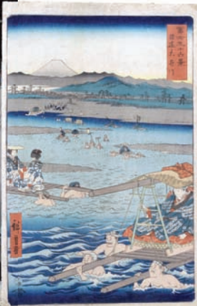
XIX century coloured Xylographies on Japanese paper, by Ando Hiroshige and Master Sadahide Utagawa.