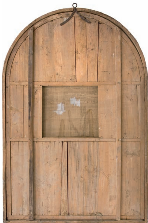
■ Wooden structure of the painting. The support system which allows the canvas to be flexible and move without causing further damage to the work was also restored.

were hand-sewn with the aid of a microscope. Finally, the restorers filled the remaining gaps with stucco and started the pictorial reintegration of the missing colours.